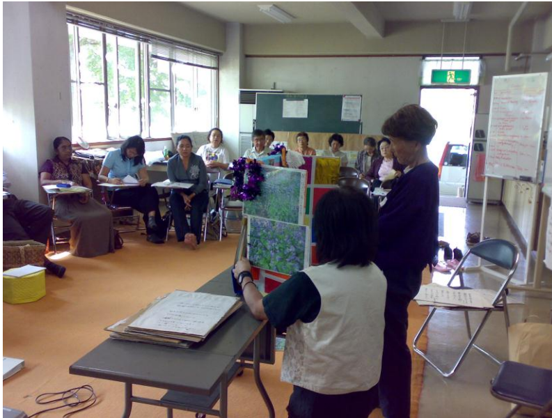
A peace activist from Nisshin presents her kami shibai panel theatre for ILDC participants.

Before and after the trip, participants furthered their own understandings of peace and peace building through health work. In particular, before the trip, AHI provided extensive orientation to peace building in Hiroshima. Participants gained basic knowledge of Japan's peace movement, security treaties, and the bombing of Hiroshima and Nagasaki through lectures and a film. They extended their knowledge of grassroots peace building by meeting with Nisshin-based activists in a workshop at AHI. The Multicultural Workshop, arranged primarily to raise diversity awareness among the Japanese public, also introduced a different aspect of peace, as harmony between different cultural groups in a society.