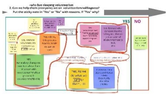
Discussion on volunteerism using Miro (online whiteboard app)