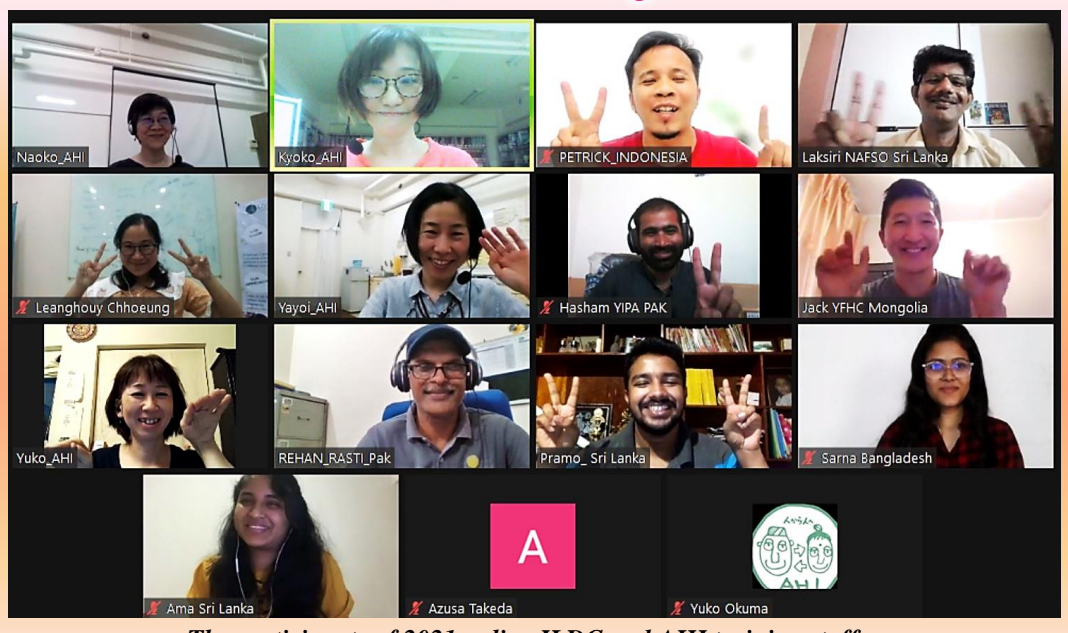
The participants of 2021 online ILDC and AHI training staff

World has been steering to become adaptive to the 'new normal' with COVID-19, and many people started seeking for new approaches to reactivating society. In the year 2021 AHI has run International Training Course (ILDC) via online setting for the first time.