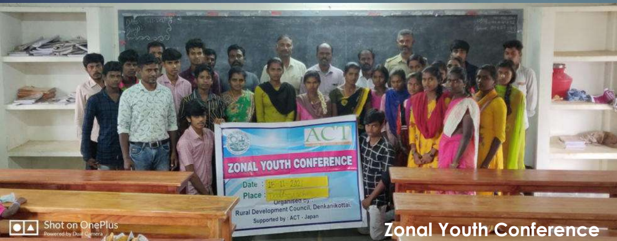
Zonal Youth Conference

Village level youth committees are in the process of legal registration as a federation