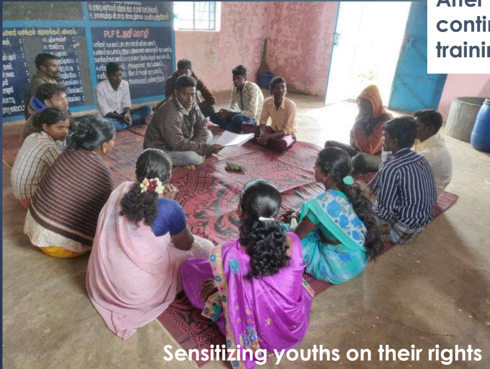
Sensitizing youths on their rights