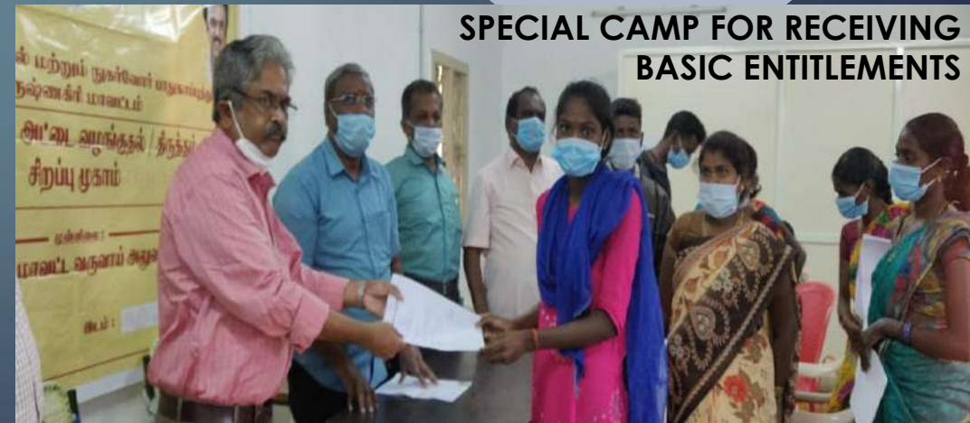
SPECIAL CAMP FOR RECEIVING BASIC ENTITLEMENTS

Youth issued a petition to the district collector requesting renovation of 42 houses